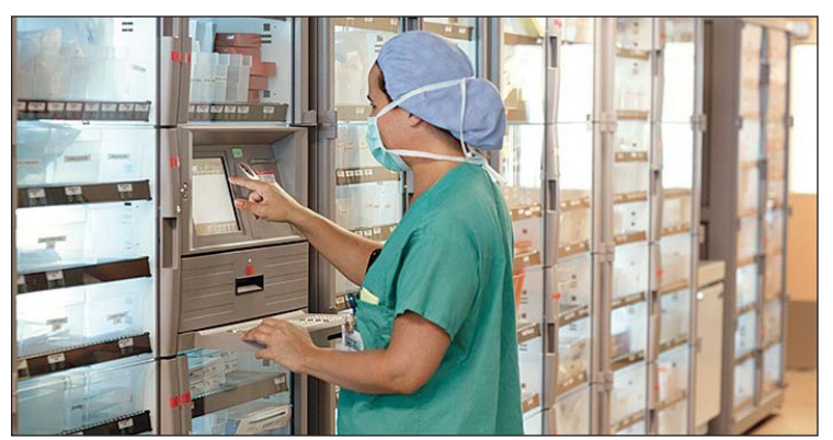
Automated Meds Management

Our project delivery teams are multidiscipline, multi-organizational teams that work with stakeholders to manage all phases of communications projects. The FTI-M program ensures proper integration and comprehensive technical services in support of FCDS to assist DoD medical facilities world-wide in their critical day-to-day operations.