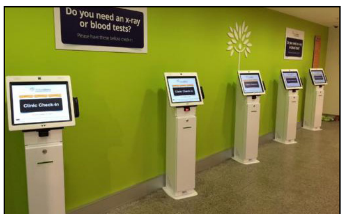
Hospital wayfinding systems